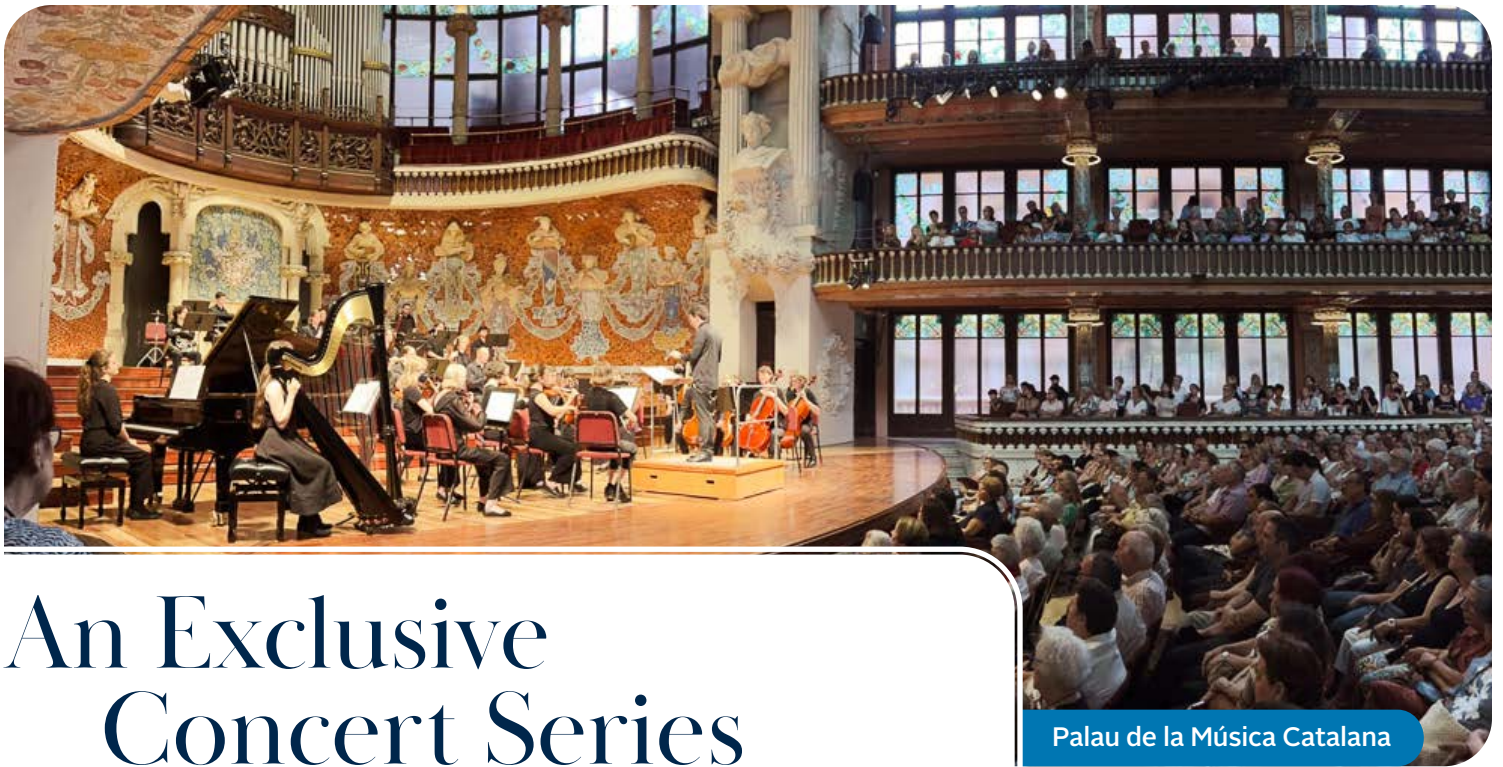
Palau de la Música Catalana